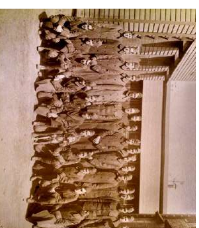
Vermont Doughboys 1919

Everyone has faced the COVID challenges throughout the year and we are extremely fortunate we can all work together to make this Convention possible.