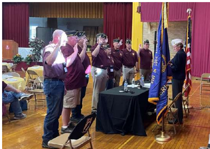
Commander Tester installing the officers of Norwich University Post #1819